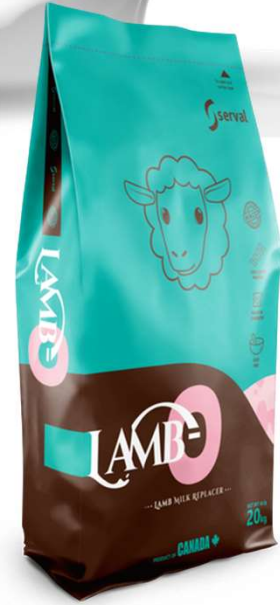
20 KG BAG

It ensures the best nutrition in order to prepare a successful productive life of the dairy ewes.